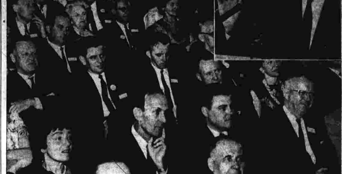
Manchester delegates hear keynote Sen. Gaylord Nelson.